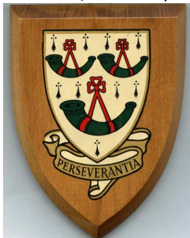
Leamington College Arms