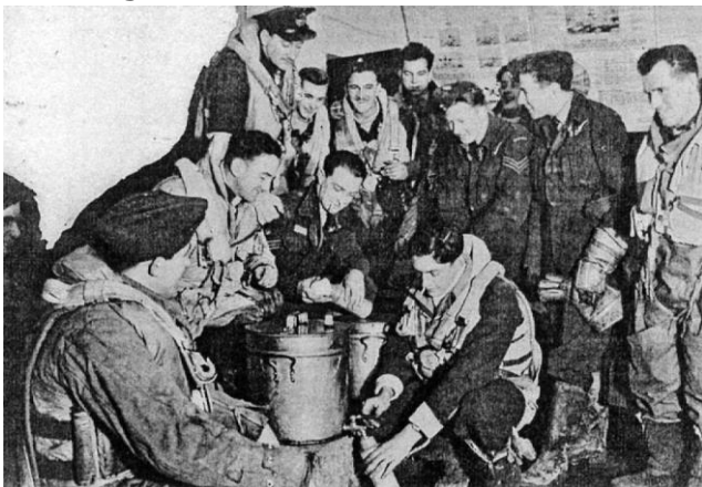
A last brew prior to take off for this 101 squadron crew with flasks being filled from the tea urn

The Special Duties Operators on 101's Lancasters were selected as volunteers from existing Bomber Command aircrew and ground crews. He was required to have a