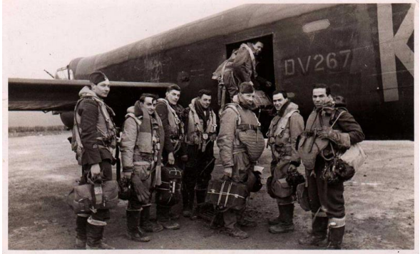
This 101 squadron Lancaster was lost over Berlin in February 1944. Three of the crew were killed; five became POWs

The Area Bombing Directive of 14 February 1942 ordered RAF Bomber Command to target German industrial areas and the residential districts of German cities, a policy which continued until the end of the war. A prolonged offensive against the Rhine - Ruhr area had laid waste to huge areas but for the Halifax and Lancaster crews engaged in these night operations there was a serious downside. By 1943 an increasing number of RAF bombers began to fall victim to German night-fighters guided onto their targets by ground controllers who could see raids developing in real time on their radar screens. Bomber losses at the time were in the order of 3% but sometimes exceeded 15% of the total number of aircraft deployed. Given this situation, it was evident that half of all Lancaster crews would not complete 15 operations.