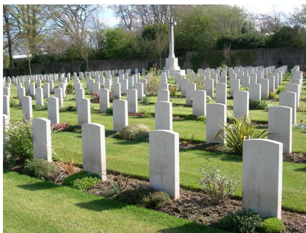
Air Force section of Harrogate (Stonefall) cemetery