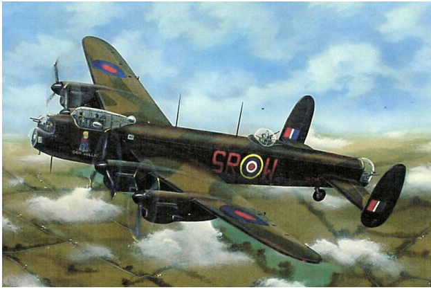
Ludford Lancaster showing the two distinctive aerials for the ABC equipment.

of seven plus the Special Duty Operator to operate the ABC. They would also carry a normal bomb load wherever possible. Externally the only thing to distinguish the ABC equipped Lancasters from the rest of the squadron Lancs were the two 7-foot loop aerials on top of the fuselage, another below the bomb-aimer's window and a shorter receiver at the top-rear of the fuselage.